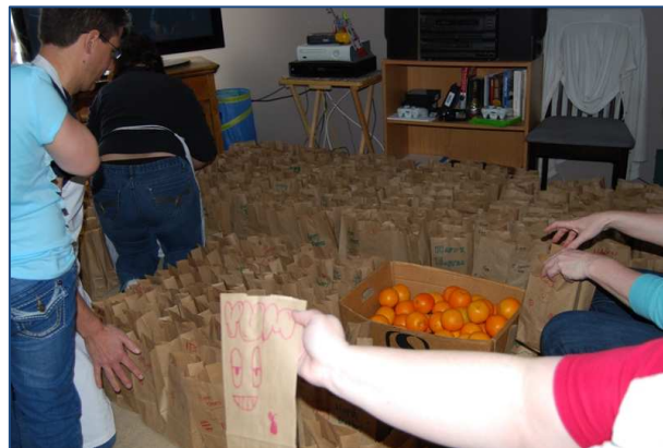
So many lunch bags filled!