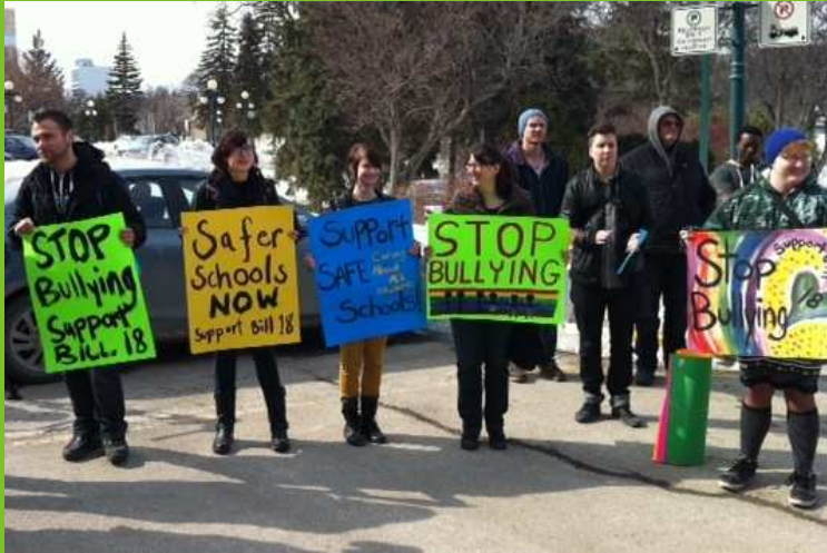
At the Rally in support of Manitoba Bill 18 on March 28 th

Published by and for the Humanists, Atheists and Agnostics of Manitoba