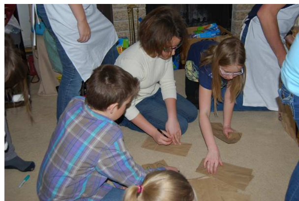
The artists at work